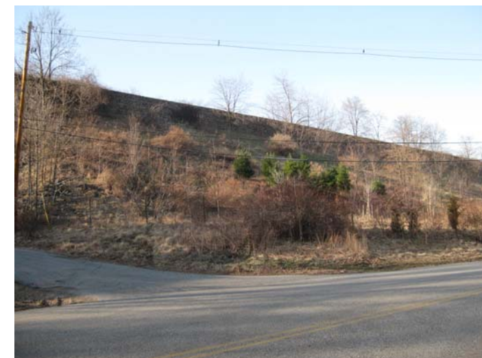
Range Example: Before